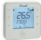
Remote control included